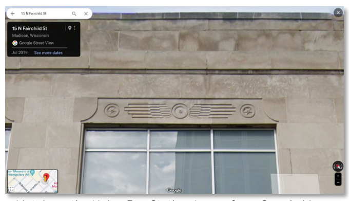
Lintels on the Union Bus Station.

owner, Hovde Properties. Hovde tied the demolition request to the approaching construction of the Wisconsin History Center on the corner of North Carroll Street and West Mifflin Street, suggesting the demolitions were necessary for "safety" reasons. The proposed demolition of all six buildings was scheduled to be reviewed by the Plan Commission at its meeting on February 26.1