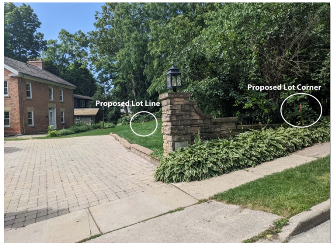
Perspective from the driveway entrance to the Tavern/Inn site.

Last month's Advocacy News included an opinion piece relating to the July 11 th action of the Landmarks Commission to okay a revision of the size of the two lots making up the site of the Old Spring Tavern. The Tavern/Inn overlooks the Arboretum's Duck Pond across Nakoma Road and was constructed in 1854 as a stagecoach stop. It was designated as a Madison landmark soon after the adoption of Madison's landmarks ordinance. 1 There was so little time between when the Madison Trust first learned of the proposed change in